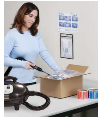
Fill-Air® RF P40 Portable Inflator

The Portable Inflator can be set up anywhere. The Pneumatic Inflator is ideal for both individual and online workstations.