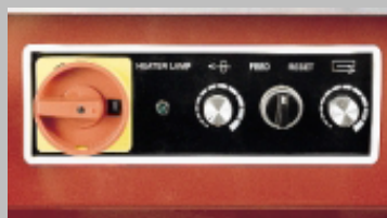
Compact Control Panel